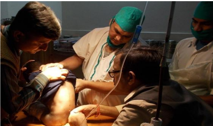
During 1st Surgery

We operated his left leg in September, 2013. After good recovery of left leg we operated his right leg on 14 th Nov, 2013. He was discharged on 23 rd Nov, 2013 having smile on face of his family.