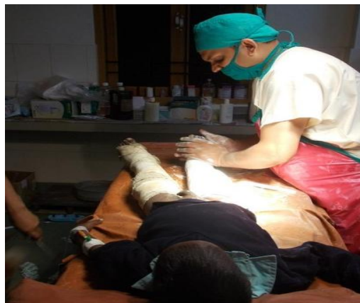
Plastering the leg